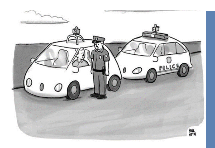
"Does your car have any idea why my car pulled it over?"